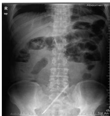
Figure 1 Abdominal X-ray showed dilation of the small intestines, gas-fluid levels and a thermometer-like object in the abdominal cavity.