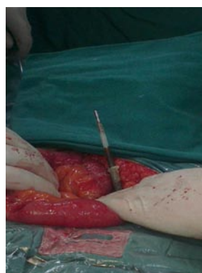
Figure 3 Thermometer coated with pus was seen pressing on the small bowels and mesentery.

In April 2013, a 45-year-old man was admitted to our hospital with a one-year history of recurrent lower abdominal cramps. The symptoms could be alleviated with antibiotic treatment. Two days before admission, the abdominal cramps aggravated, and defecation and flatus stopped. On physical examination, he had a regular pulse