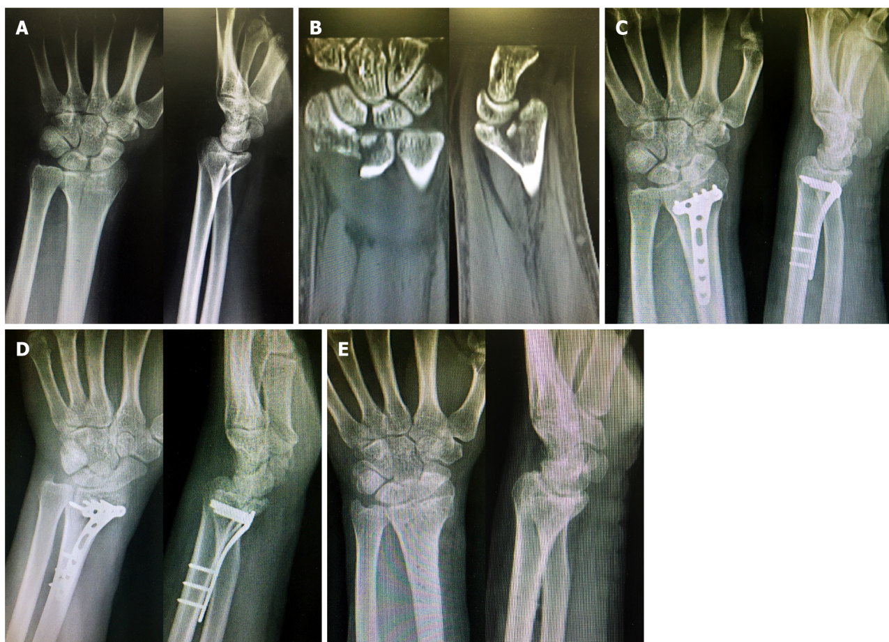
Figure 3 A 39-year-old man from the unfixed group with distal radius fracture with volar margin of the lunate fossa fragment due to a traffic accident. A and B: Preoperative X-ray and computed tomography; C: At 1 d posttrauma, open reduction and internal fixation with a volar locking plate and screws were performed. Immediately postoperatively, the X-ray showed a radiolunate angle (RLA) of -16^{\circ} and effective radiolunate flexion (ERLF) of 19^{\circ} ; D: At 1 mo postoperatively, the X-ray showed that the RLA was -38^{\circ} , and the ERLF was to 39^{\circ} ; E: This appearance persisted even after plate and screw removal at 1 year postoperatively. The Mayo score was 65, and the disabilities of the arm, shoulder, and hand score was 30.8.

attached to this location. The SRL is important for maintaining the stability of the radiocarpal joint and bears more load than the ligaments attached in the scaphoid fossa. A quantitative three-dimensional CT study has shown that 16% of the lunate facet projects anteriorly from the flat surface of the radius[28]. This bony projection has a mean thickness of 5 mm and width of 19 mm, which is susceptible to fracture but difficult to control with plates and screws alone.