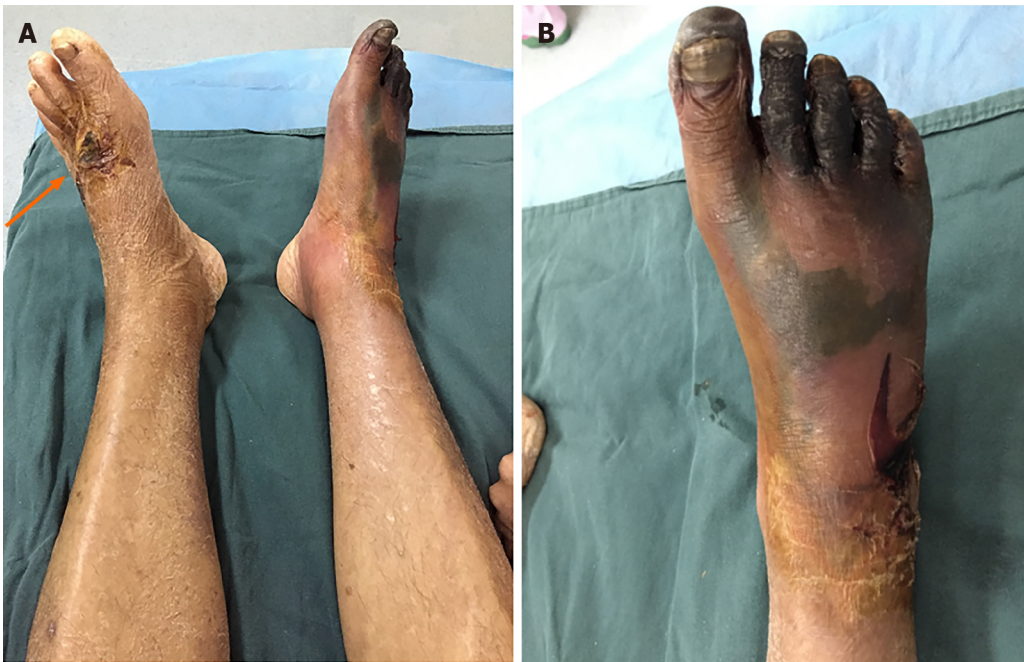
Figure 1 Physical examinations. A: The bitten area (orange arrow); B: The skin of the right foot became black in the right foot, accompanied by blister formation and exudate. Tissue necrosis was found on the toes.