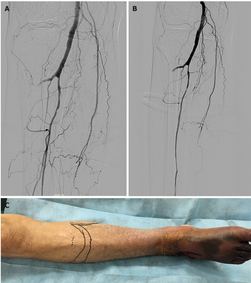
Figure 3 Angiography and physical examinations of the right anterior tibia. A: On the sixth day of thrombolytic therapy, the proximal right anterior tibial and peroneal arteries were imaged by angiography; B: The right anterior tibial artery and peroneal artery were treated by low-pressure balloon dilatation; C: The amputation level was 9 cm below the right tibial plateau (marked with a marker pen).

dynamic changes, therefore, thrombolytics were deemed safe for him.