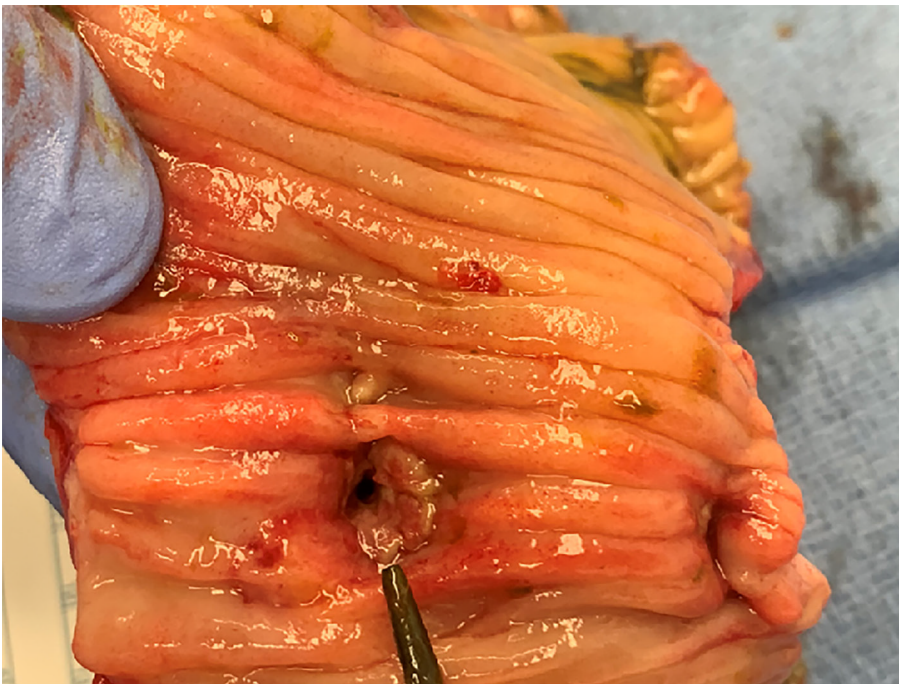
Figure 3 Internal opening of perforation.

perforation from migrated biliary stent describe either duodenal perforation or large bowel perforation, with very few cases of small bowel perforation. Most patients with perforation will present with diffuse peritonitis and signs of sepsis. In our patient, we believe the amount of infection was limited by the perforation happening slowly over time, and her septic response was also blunted by her HIV with a low CD4 count. A growing body of literature exists on this topic and different treatment approaches have been proposed. Diller et al [10] reported a case series of stent migration necessitating surgical intervention in 2003. The size of the stents varied between 7 and 14 Fr and the lengths ranged from 7 to 12 cm. Two patients had Polyurethane stents, one patient had Teflon stent placement and the other two patients had metallic stents. The diagnosis was biliary obstruction from acute pancreatitis in 4 patients and the fifth patient