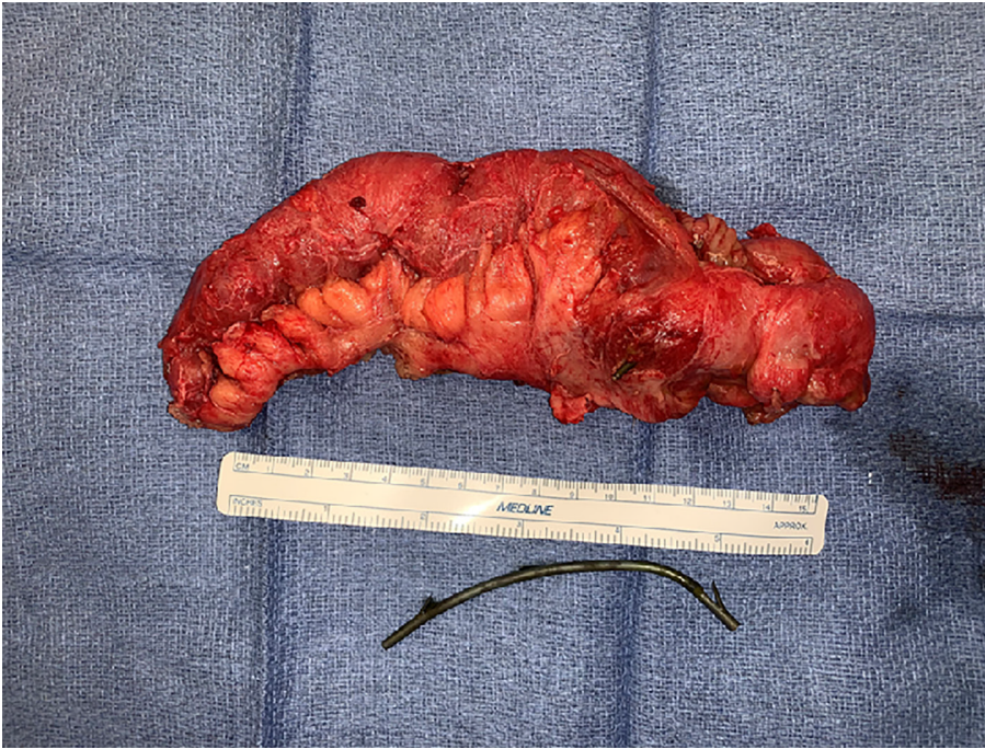
Figure 2 Small bowel segment with stent perforating through it, together with second migrated stent.