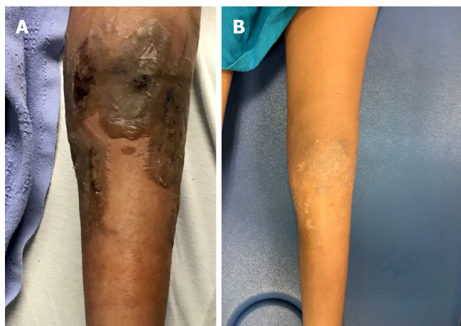
Figure 2 Patient 2. A: Left knee operative site, one week post-operation and use of Prineo™ for wound closure; B: Left knee operative site, six weeks post-operation.