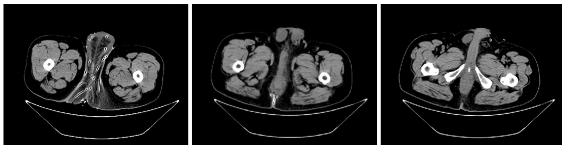
Figure 3 A lower abdominal and pelvic computed tomography scan on day 3 postoperation.

performed as described above (Figure 4).