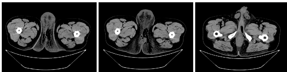
Figure 2 A lower abdominal and pelvic computed tomography scan on admission.