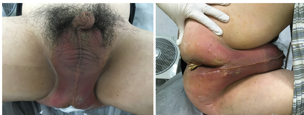
Figure 1 The condition at the time of admission.

cleaned and changed daily. The surgical area was rinsed with 1:1 hydrogen peroxide and oxygenate and the necrotic tissue was trimmed. The rubber setons were removed after pus was no longer observed.