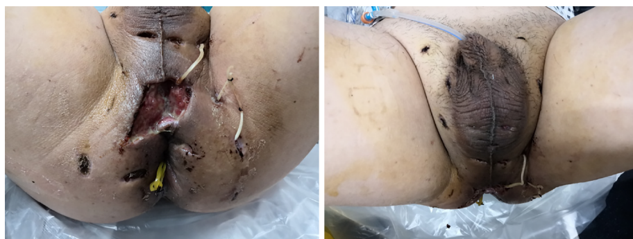
Figure 5 Two weeks postoperation (before discharge).

What's more, the key to cure necrotizing fasciitis is timely and thoroughly debriding the affected area[9]. The reason why we performed surgery immediately after the patient's admission was based on the symptoms and examination findings, which surely confirmed the diagnosis. Since necrotizing fasciitis is always caused by anaerobic bacteria, complete debridement is one of the treatment principles. Drainage of the wounds makes the oxygen in the air to react with anaerobic bacteria. The physiological effects have the ability to enhance leukocyte to kill aerobic bacteria, stimulate the formation of collagen and increase the levels of superoxide dismutase, resulting in better tissue survival[10]. Hydrogen peroxide is also used to achieve this effect in dressing change. Sometimes, patients will even be placed in an environment of increased ambient pressure for breathing 100% oxygen to take hyperbaric oxygen therapy. Adequate oxygenation has the benefits of optimal neutrophil phagocytic function, inhibition of anaerobic growth, increased fibroblast proliferation and angiogenesis, reduction of edema by vasoconstriction, and increased intracellular antibiotics transportation[11]. More and more studies demonstrated that hyperbaric