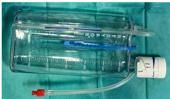
DOI: 10.3748/wjg.v28.i14.1394 Copyright © The Author(s) 2022.

Figure 1 Endo-SPONGE® kit including open-pore sponge drain (a), two silicon overtubes (b), the sponge pusher (c), and the irrigation set (d).