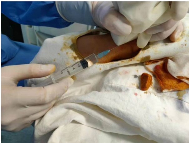
Figure 2 Sonographer held the probe covered with surgical gloves with one hand and did needle release of the superficial branch of radial nerve continuously under continuous guidance of ultrasound.

In this case, we found that after traumatic neuroma resection and nerve anastomosis, the patient felt numbness in the dorsal surface of the right thumb and obvious tenderness in the surgical area. US revealed that the SBRN was adhered to the surrounding tissues. NSAIDs administered for 3 mo were ineffective. The patient refused further surgical treatment. Thus, we used US-guided needle release plus corticosteroid injection to relieve the adhesion between the SBRN and the subcutaneous soft tissue for the first time. Under US guidance, we observed the needle in real-time thus improving accuracy and safety. A short-axis view of the nerve and an in-plane view of the needle were performed in order to view the outline of the SBRN and the approach of the needle. We also rotated between short-axis and long-axis views of the SBRN. The process of acupuncture release was continued until there was no resistance between the syringe and the tissues around the RN. A mixture of 1 mL corticosteroid (betamethasone) and 2 mL 2% lidocaine was then injected around the SBRN in the area of severe adhesion. The injection of corticosteroids can reduce pain and swelling.