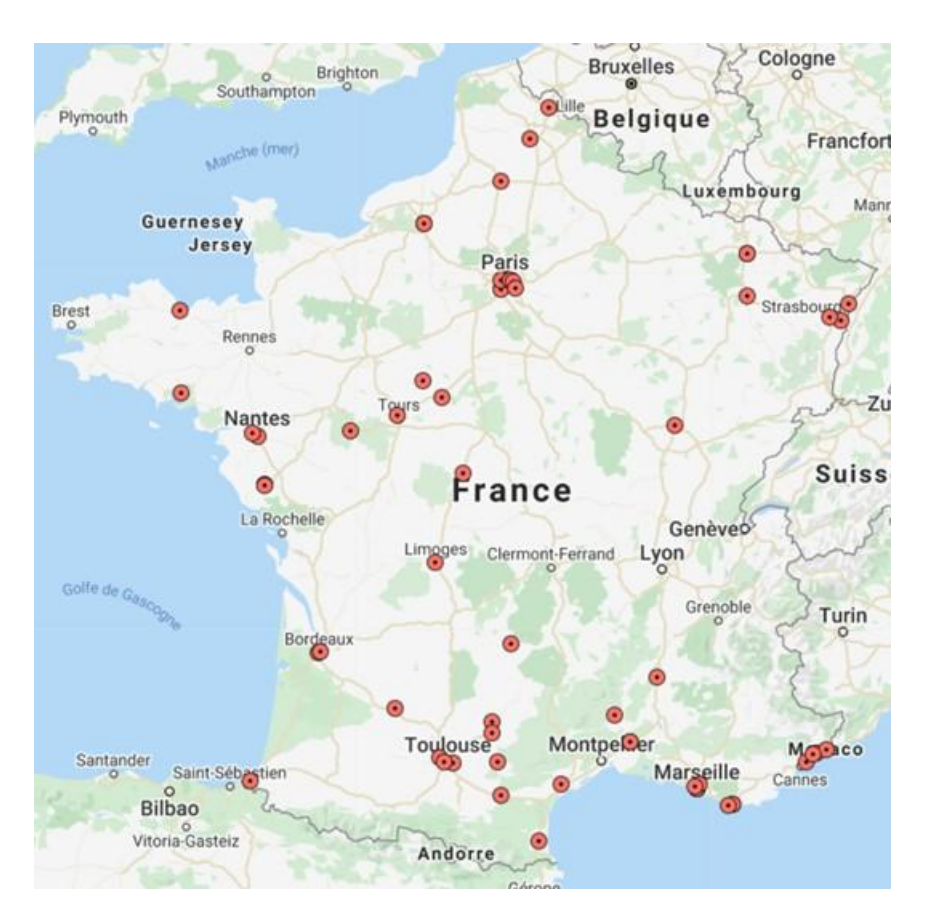
Supplementary Figure 1 Distribution of investigator centers throughout France.