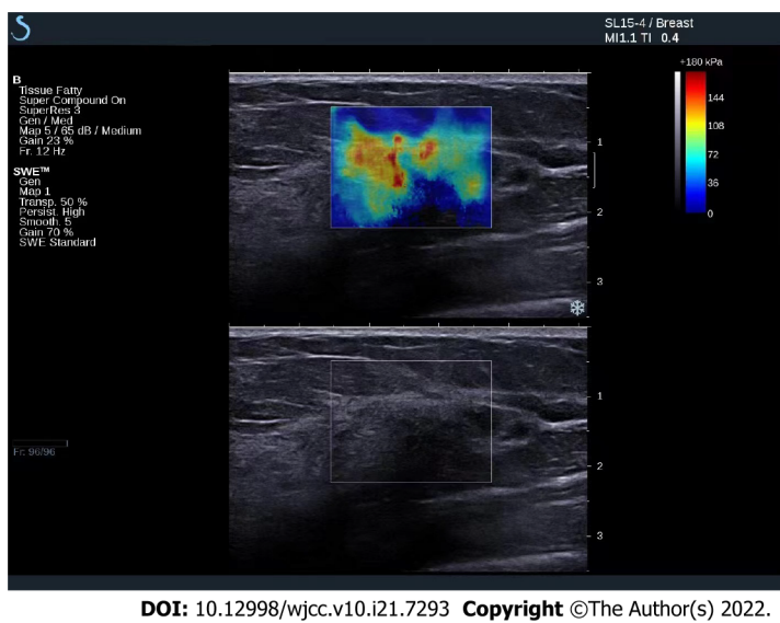
Figure 1 Strain ultrasound elastography examination chart of a patient. A 45-year-old female patient with invasive ductal carcinoma, strain ultrasound elastography elasticity score of 4 points, strain ratio of 2.06, curative effect after neoadjuvant chemotherapy is pathological complete remission.