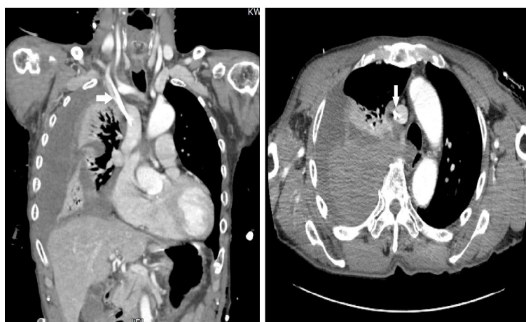
DOI: 10.12998/wjcc.v10.i17.5776 Copyright ©The Author(s) 2022.

Figure 2 Postoperative chest computed tomography taken upon arrival in the recovery room. There is large amount of hemothorax in the right hemithorax with no evidence of extravasation of contrast media. The central catheter (arrows) is located within the superior vena cava