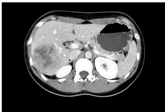
Figure 1 A computed tomography scan with nonionic contrast confirmed a mass located in the posterior right lobe within segments VI-VII and measuring 7.2 cm × 6.0 cm. The lesion demonstrated peripheral enhancement with central necrosis but no evidence for portal vein invasion. The hepatic veins were patent and no biliary dilatation was observed. No pulmonary lesion was highlighted.

perihilar or Klatskin tumor (PCC) and distal extrahepatic cholangiocarcinoma [5] . Tumor features and behavior seem to vary according to its type, thus, the importance of a precise classification that will influence the management and eventual outcomes. ICC are located above the second-order bile duct that represents the segregation point from PCC. They account for approximately 10%-20% of all primary liver cancers [2-4] and their incidence has been reported to increase disturbingly, especially within Western countries [6-8] . It is also characterized by its poor prognosis despite liver resection although surgery is considered as the only curative treatment. Studies have reported a 3-year survival rate of 22%-55% after extended surgery [9-13] whereas survival rate without surgical treatment was much poorer at 7%-21% [8,9,12] . The reason for this could be that ICC are longer clinically silent being often diagnosed at an advanced stage but also their strong tendency to recur. Postoperative recurrences were mainly located in the remnant liver whereas extrahepatic recurrences especially involved lymph nodes, lungs and peritoneum [9,14] . To our knowledge there is no case of pancreatic metastasis from ICC being reported in the literature. Thus, this case report is the first to address this interesting issue.