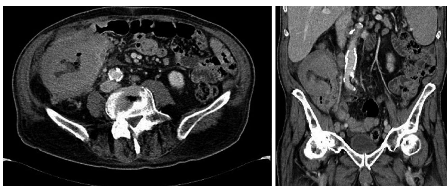
Figure 2 Computed tomography exam in the axial and coronal planes. The images show the concentric thickening of the wall of the cecum and ascending colon. The millimetric air bubbles in the context of the colic wall are also depicted.