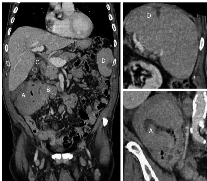
Figure 3 Coronal computed tomography scan (portal venous phase). The images show the large colic lesion at the level of the hepatic flexure (A), the large necrotic lymphadenopathy close to the lesion (B), the stone in the lumen of the gallbladder (C) and the hypodense area in the context of the spleen indicative of the ischemic outcomes (D).