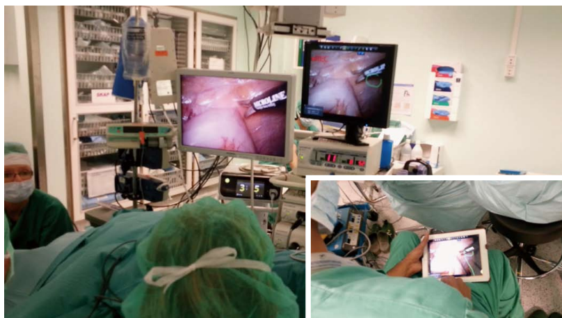
Figure 5 Onsite telementoring in the urology department at the university hospital UNN Tromsø Norway.