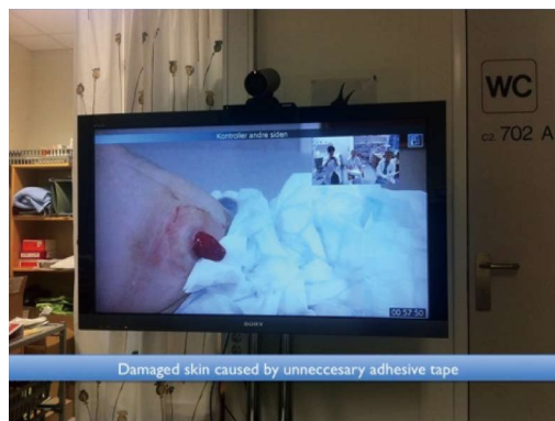
Figure 2 Stoma and post-operative wound care videoconference.

Postoperative follow-up: VC is used as an application for the follow-up of patients during the postoperative period and for outpatient consultation. In our institution, in partnership with the Norwegian Center of Integrated Care and Telemedicine, VC is being used for the follow-up of hemodialysis patients [15] , dermatology and orthopedics [8,16,17] .