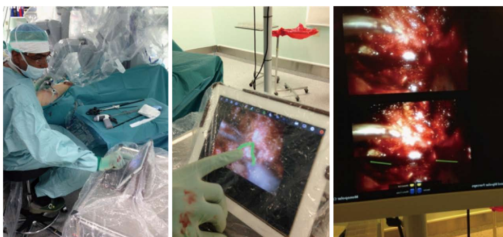
Figure 6 Robotic bedside telementoring using a unique low cost prototype.

ducted successfully in colorectal surgery: abdominoperineal resection and in urological surgery: Adrenectomy, Nephropexy, and Robotic assisted laparoscopic prostatectomy. Three mentoring methods were used: (1) Active “hands-on” telementoring: the mentor was scrubbed and assisting in the surgery, using the tablet as a tool to enhance his verbal instructions with telestration using the tablet (Figure 4); (2) Passive/on-site mentoring-the mentor was present in the operating room but unscrubbed using the tablet to draw illustrations while guiding the mentee surgeons through the operation (Figure 5); and (3) Bed-side mentoring in robotic surgery: the mentor was scrubbed-in and assisting bed-side (Figure 6). All experiments were successful, we are planning in the near future off-site telementoring both short distances and transcontinental.