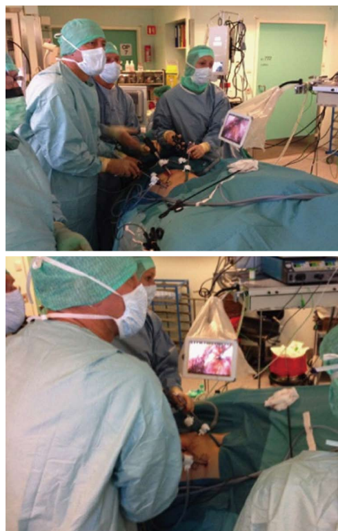
Figure 4 Tablet based mentoring in colorectal surgery at the university hospital UNN Tromsø Norway.

Laparoscopic surgery requires a high degree of spe-