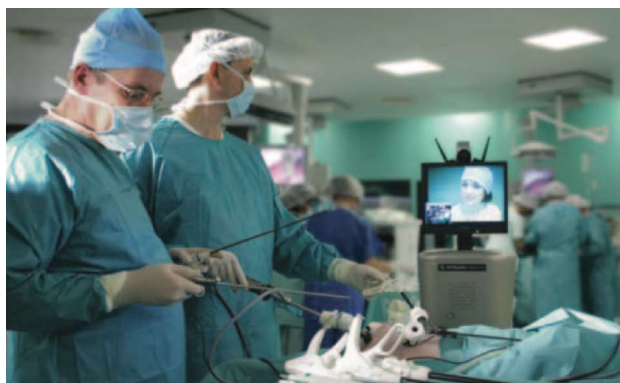
Figure 1 RP6 robot during laparoscopic telementoring [14] .

ISDN: Integrated services digital network; VC: Video conferencing.