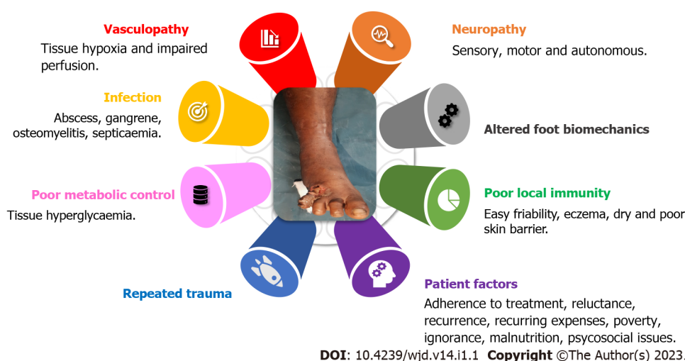
Figure 1 Pathogenesis of diabetic foot ulcers.

resistance, type 2 diabetics are more likely to suffer from long-term complications of vasculopathy, neuropathy, and diabetic ulcers in the lower limbs[1,6]. Irrespective of age, gender, region, or culture, the pathophysiology of a DFU remains the same. Two or more risk factors, often peripheral neuropathy and frequently vasculopathy, are always present[6] (Figure 1).