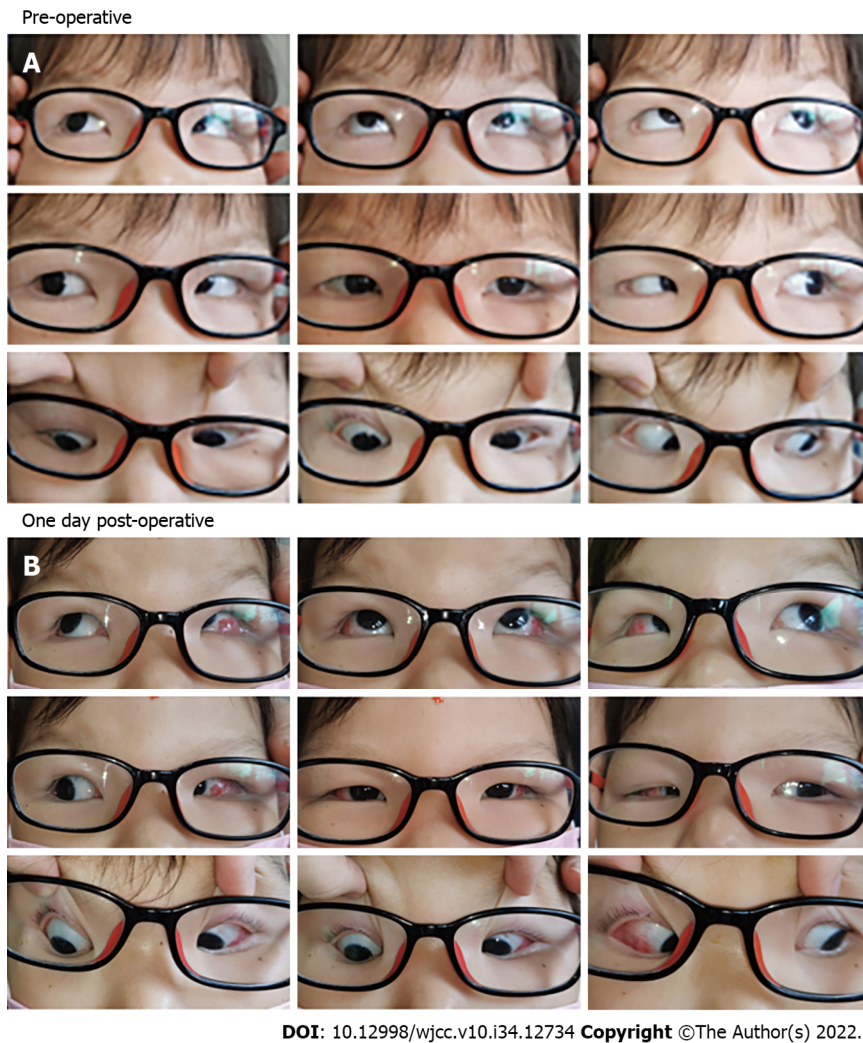
Figure 4 Pre-operative and one day post-operative alignment of patient 2. A: Case 2 had -50 prism diopter in the primary position before the surgery; B: After bilateral lateral rectus recession surgery, the patient's exotropia was significantly relieved on the secondary day of surgery.

early surgery[12]. Additionally, case 1 was diagnosed with myopia in the left eye, given that early-onset severe myopia is a frequent clinical manifestation of PTHS, the AL of the patient's left eye was 25.70 mm and much longer than the right, and the left funduscopy revealed slight visibility of the large choroidal vessels. PSR was considered to slow AL elongation and prevent highly myopic complications.