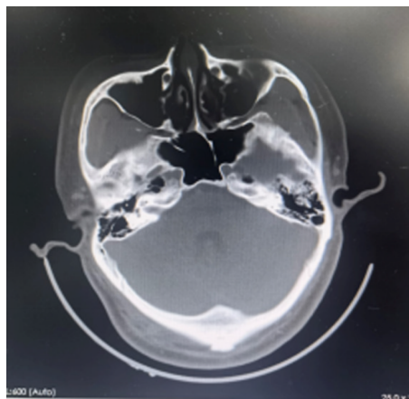
DOI: 10.12998/wjcc.v11.i25.6000 Copyright ©The Author(s) 2023.