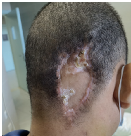
DOI: 10.12998/wjcc.v11.i25.6000 Copyright ©The Author(s) 2023.