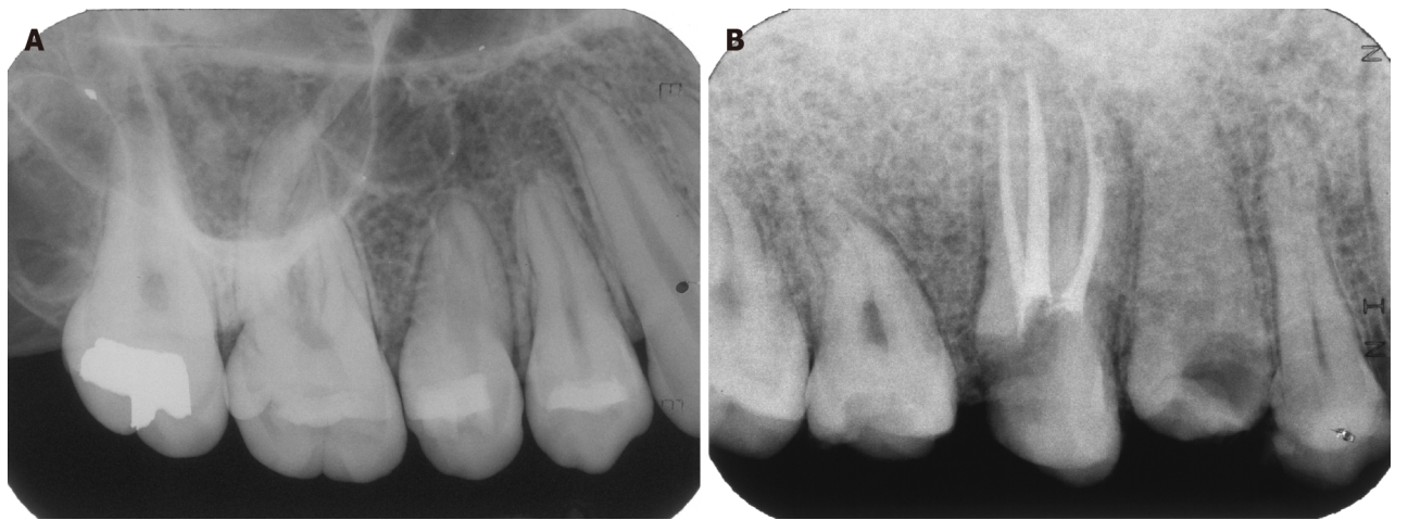
Figure 2 Radiographic image. A: Dry human maxillary bone periapical radiographic image; B: Gypsum-rice maxillary phantom periapical radiographic image.

bone aspects in radiographs is complex because it requires the simultaneous assessment of diverse features, including the bone trabecular pattern, density, thickness, horizontal alignment, and space between trabeculae[2,10,11]. As well, the absence of significant differences between groups may have occurred because of the subjectivity involved in assessing each of these characteristics. Further, a wide variation in observer performance in the periapical radiological diagnoses has been widely recognized[24,25], and the previous experience of each observer may have influenced the interpretation of early periapical intraoral radiographs, as explained by Patel et al [22]. In this study, the interexaminer agreement for the bone aspect (0.43) was fair, even though the radiographs were viewed in the same light box and with the same radiographic mask, which are considered to improve interobserver agreement[22]. In addition, substantial variations in individuals' interpretations of radiographic images were common-