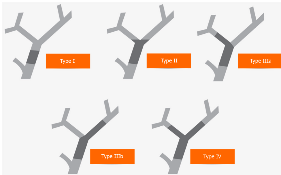
Figure 2 Bismuth-Corlette classification. Type I: Below the confluence of left and right hepatic ducts; Type II: Reaching confluence but not involving left or right hepatic ducts; Type III: occluding common hepatic duct and involving either the right (IIIa) or left (IIIb) hepatic duct; Type IV: Involving the confluence of both right and left hepatic ducts; bilateral intrahepatic segmental involvement or multicentric.

confirmation and disease staging in the context of Bismuth-Corlette classification (Figure 2) to determine resectability and offer preoperative planning. Biliary strictures remain indeterminate without confirmatory histology, posing a diagnostic dilemma to stratify management decisions. Although in patients with hCCA, preoperative histological confirmation may not be required, around 20% with benign biliary strictures may undergo major surgery for suspected biliary malignancy [62].