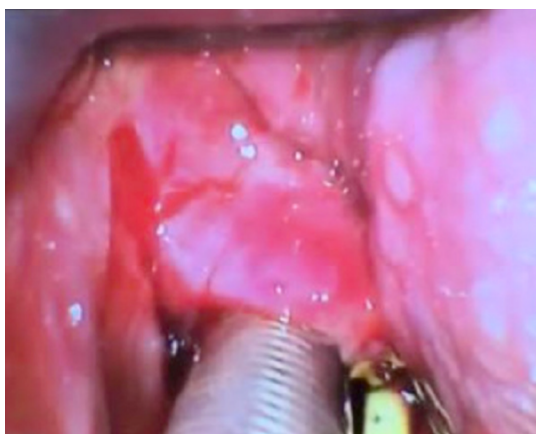
Figure 2 Hypopharynx of the airway in the operating room on postoperative day 1.

Due to the severity and extent of the disease, the dermatology team re-initiated dapsone therapy and prescribed a course of intravenous methylprednisolone and a single dose of both cyclophosphamide and IVIG. Overnight, the patient was observed to have a few isolated episodes of agitation that resulted in spontaneous bleeding; therefore, the oropharynx was repacked with epinephrine- and tranexamic acid-soaked Kerlix. On postoperative day 3, the ENT team removed the oral packing. On postoperative day 4, the patient returned to the operating room and was successfully extubated to cool, humidified air via a face mask. She received a dose of intravenous cyclophosphamide and was discharged 2 d later with a course of prednisone daily and dapsone with a follow-up for a second intravenous cyclophosphamide infusion planned in 1 mo. A timeline of this case can be seen in Figure 3 .