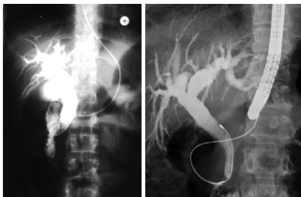
Figure 2 An ERCP showing markedly dilated bile ducts without an obstructive cause. Note the nasobiliary tube for drainage in the first image.

the sphincterotomy site. This was controlled with local adrenaline injection. Eight patients (3.3%) developed transient mild pancreatitis.