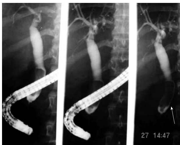
Figure 3 ERCP showing biliary sludge in a patient with SCD. An arrow indicates the site of biliary sludge.