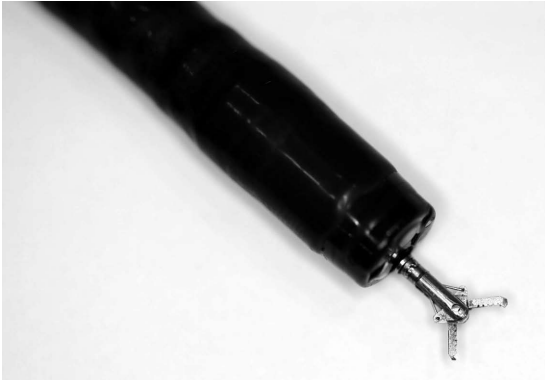
Figure 1 Distal tip of the grasper type scissors. GTS has teeth inside the device and the outer side is not insulated. GTS: Grasper type scissors.