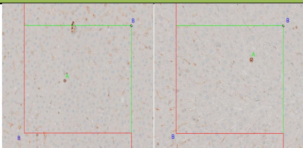
Supplementary Fig. 3: Stereological counting rules.

To the left a STD animal euthanised two days after hepatectomy. To the right a HFCD animal euthanised two