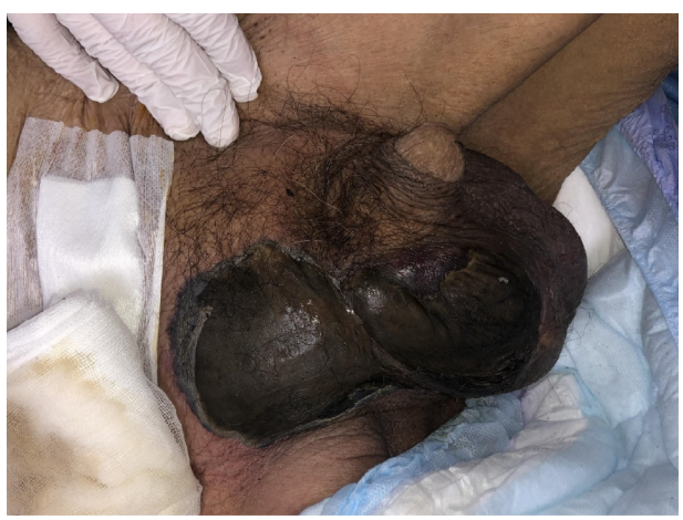
DOI: 10.12998/wjcc.v11.i27.6498 Copyright ©The Author(s) 2023.