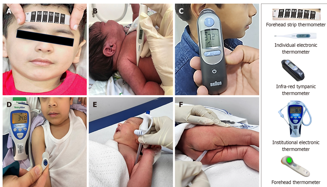
Figure 1 Routes and types of thermometers used for temperature measurement in children. A: Forehead strip thermometer; B: Individual axillary electronic digital thermometer; C: Infra-red tympanic thermometer; and institutional electronic digital thermometer; D and E: Axillary; F: Rectal. Forehead strip thermometer, axillary chemical dot thermometer; and oral/sublingual thermometer are not recommended to be used in children.