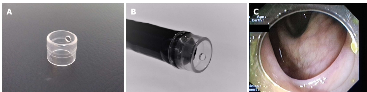
Figure 1 Cap (A) mounted on the tip of the scope (B) and the endoscopic view (C).

short cap was also related to a shorter cecal intubation rate, but without any difference in the rate of polyp detection [17] . Horiuchi et al [16] randomized 60 patients diagnosed with colonic adenomas to repeat colonoscopy in three months, with or without a 7 mm cap; all lesions were removed during the second examination. Cap-assisted colonoscopy detected 20% more adenomas compared to a 4% increase in adenoma detection without the cap [16] . Moreover, a small back-to-back RCT of 67 screening/surveillance patients demonstrated a reduced adenoma miss rate associated to cap-assisted colonoscopy compared to conventional colonoscopy (21% vs 33%; P = 0.04 ) [19] .