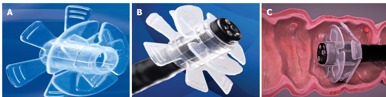
Figure 4 Endorings (A) mounted on the tip of the scope (B) and illustration of rings stretching during withdrawal phase (C).

the device especially for lower detectors [51] . Furthermore, a numerical higher MAC was detected in the Endocuff-assisted colonoscopy group, but this difference did not reach statistical significance [mean difference (95%CI): 0.11(-0.17 to 0.38) [51] . Mean insertion times did not differ between the two groups and 4% of the Endocuff patients experienced adverse events (exclusively minor lacerations) [51] . This meta-analysis reported on additional outcomes such as advanced ADR and right colon ADR, with no difference detected between the two groups [RR (95%CI): 0.93 (0.76-1.13), P = 0.47 and RR (95%CI): 1.36 (0.80-2.34), P = 0.26 , respectively]. However, the small number of studies included in the analysis regarding these outcomes warrants caution when attempting to generalize the respective results.