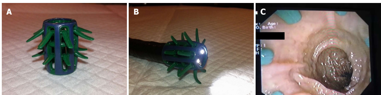
Figure 2 Endocuff (A) mounted on the tip of the scope (B) and the endoscopic view of the hinged projections during the withdrawal phase (C).

1 refers to right colon ADR; 2 refers to both first generation Endocuff and Endocuff Vision; 3 network meta-analysis. a Statistical significant. ADR: Adenoma detection rate; AMR: Adenoma miss rate; PDR: Polyp detection rate; MAC: Mean adenomas detected per colonoscopy; CIR: Cecal intubation rate; CIT: Cecal intubation time; CAC: Cap-assisted colonoscopy; CC: Conventional colonoscopy; EAC: Endocuff-assisted colonoscopy; FP: Full paper; AB: Abstract; RCT: Randomized controlled trial; NR: Not reported; OR: Odds ratio; 95%CI: 95% confidence intervals; RR: Relative risk; MD: Mean difference.