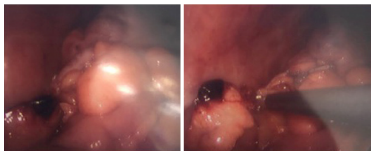
Figure 2 Infarcted appendiceal epiploic appendage at the tip of the appendix (Intraoperative).

WBC: White blood cell; RLQ: Right lower quadrant; CT: Computed tomography.