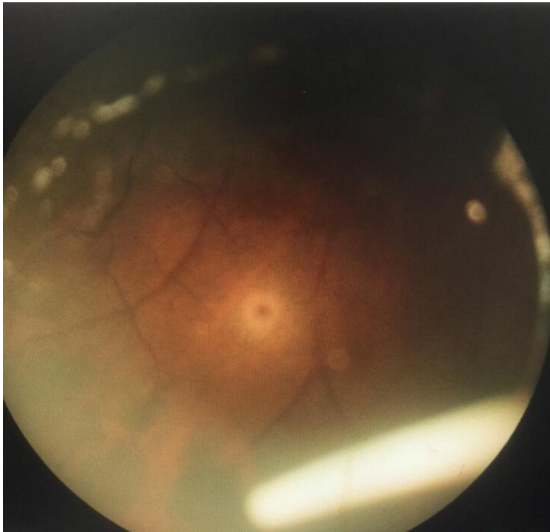
Figure 2 Ozurdex in the inferior of the vitreous cavity.