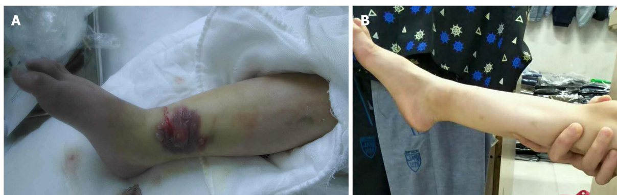
Figure 1 Typical case 1. A: A 19-mo-old child had cyanosis and purpling accompanied with multiple blisters at the right medial malleolus from infusion of potassium chloride + concentrated sodium chloride. In addition, swelling of the distal two-thirds of the right leg and dorsum pedis, as well as cyanosis at the dorsum pedis and toes, were found; B: Results at 17 mo after treatment.

scapulohumeral periarthritides, keloids, and chronic prostatitis[28-30] and for infusion infiltration as well[10,20,31]. At our hospital, local blockage is routinely performed using dexamethasone, lidocaine, and normal saline.