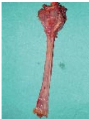
Figure 2 Synchronous invasive carcinomas of the hypopharynx and thoracic esophagus.

carcinoma. In addition, second primary tumor could be of early stage and does not cause subjective symptoms even in absence of proximal obstruction. Kohmura et al [6] support the view that in patients with obstructive hypopharyngeal carcinomas MRI should be performed. According to this data, esophageal mass lesions or hypertrophic mucosa detected by MRI require esophageal blunt dissection, due to possibility of multiple primary malignancies. In addition, Kohmura et al [6] proposed that there is little chance of multiple malignancies in the esophagus if there are no abnormalities by MRI. They also pointed out that endoscopic evaluation is favorable whenever is feasible. However, many authors agree that the role of MRI in the examination of gastrointestinal tract, apart from the liver, is limited [17,18] . CT has shown similar limitations in the diagnosis and staging of esophagogastric tumors with accuracy rate of only 60% or less [19,20] . Many others [21-23] agree that endoscopic ultrasonography (EUS) has clearly showed superior accuracy for T and N staging of esophageal and gastric carcinoma as compared with CT, but has the same limitations as endoscopic examination in the patients with obstructive tumors. Miniprobe sonography showed favourable results in the diagnosis and staging of esophageal tumors [18] , but unfortunately, in most institutions is not available in routine clinical practice.