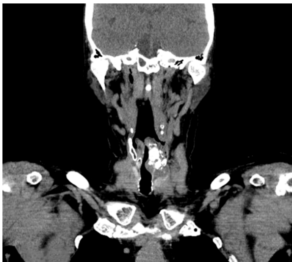
Figure 1 Computed tomography of laryngeal chondrosarcoma.