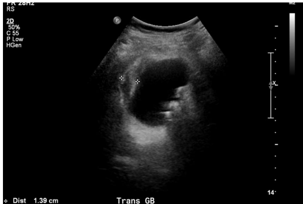
Figure 1 Ultrasound image demonstrating a pronounced gallbladder wall thickening and stones, consistent with acute colecystitis.