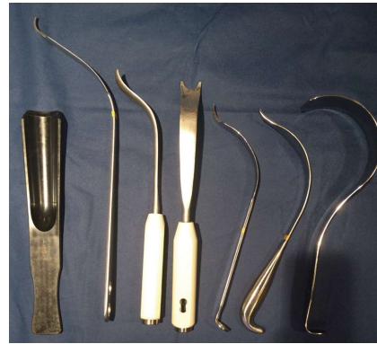
Figure 3 Selected retractors used for direct anterior approach. From left to right, hip skid for ceramic head reduction, greater trochanteric retractor/elevator, femoral elevator for medial/calcar exposure (front and side views), medial acetabular wall retractor, posterior acetabular wall retractor, and tensor fascia lata retractor.

Of note, a study of fluoroscopy-guided anterior hip arthroplasty found an early higher rate of dislocation using a goal of 10-30 degrees of anteversion, which was improved by adjusting the target angle to 5-25