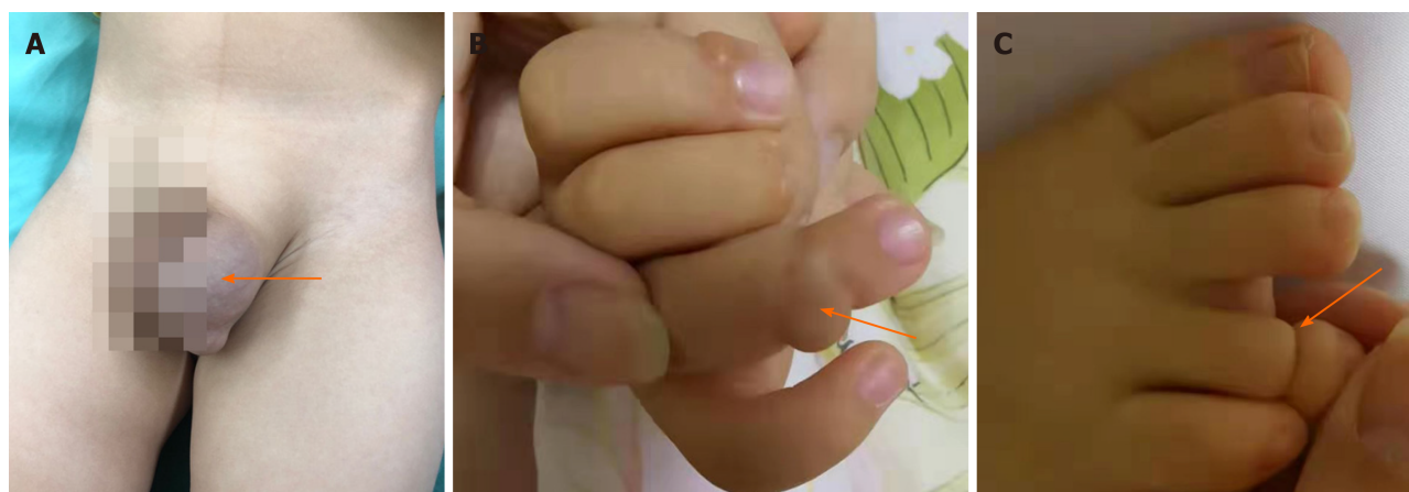
Figure 1 Physical examination. A: The patient's left inguinal hernia; B: Congenital malformations of the fingers; C: Toes.