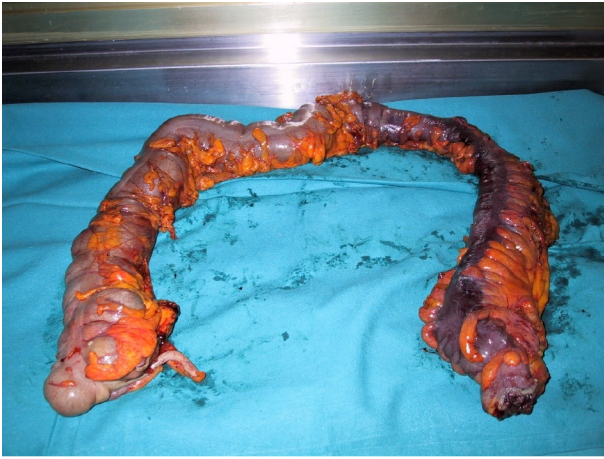
DOI: 10.3748/wjg.v28.i18.1902 Copyright ©The Author(s) 2022.