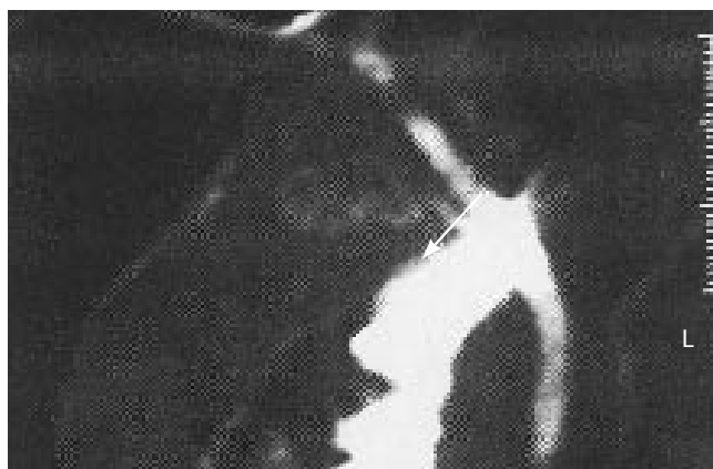
Figure 1 Cholangio-MRI showing a persistent filling defect (arrow) in the extrahepatic bile duct suspected to be biliary sludge or a stone.