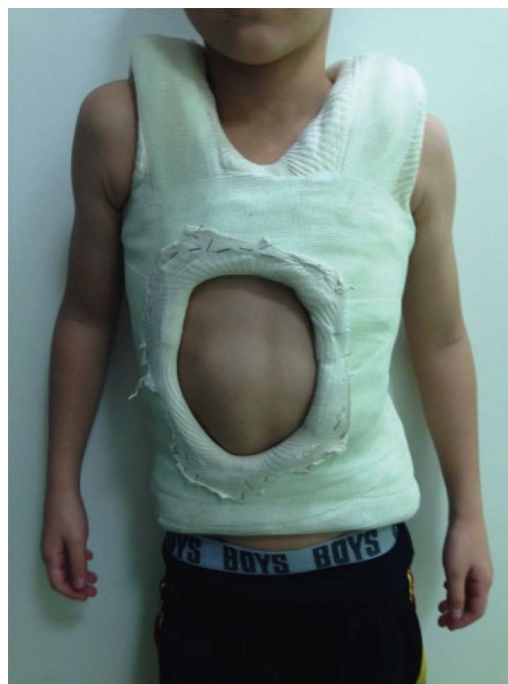
Figure 5 Elongation-derotation-flexion plaster. Final result.

The big challenge for the growing spine is to preserve