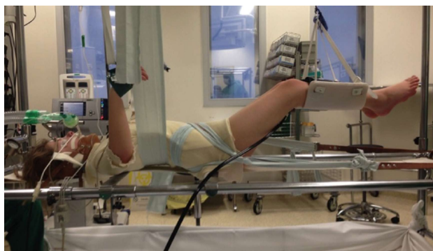
Figure 1 Positioning a patient on a Cotrel frame. Lateral view. Proximal point of traction is the chin and distal point is at the iliac crests. Harnesses and straps are employed, and amount of traction is controlled.

is necessary to reduce the risk of severe respiratory insufficiency [2,5,7] .