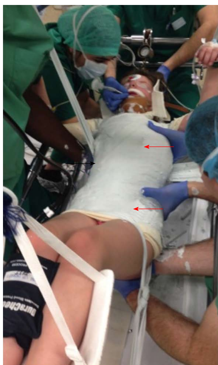
Figure 4 Spinal deformity correction. While the plaster is still malleable, one-hand lateral pressure (dotted arrow) is applied on the convexity side (apical vertebra) and two-hand counter-pressure is applied on the concavity side as close as possible to the end vertebrae, and both pressures are maintained until the plaster hardens (red arrows).

and found that casting led to only transient pulmonary restriction: peak inspiratory pressure increased by 106% at cast application but fell back to near-baseline values once the thoraco-abdominal straps were cut free [13] .