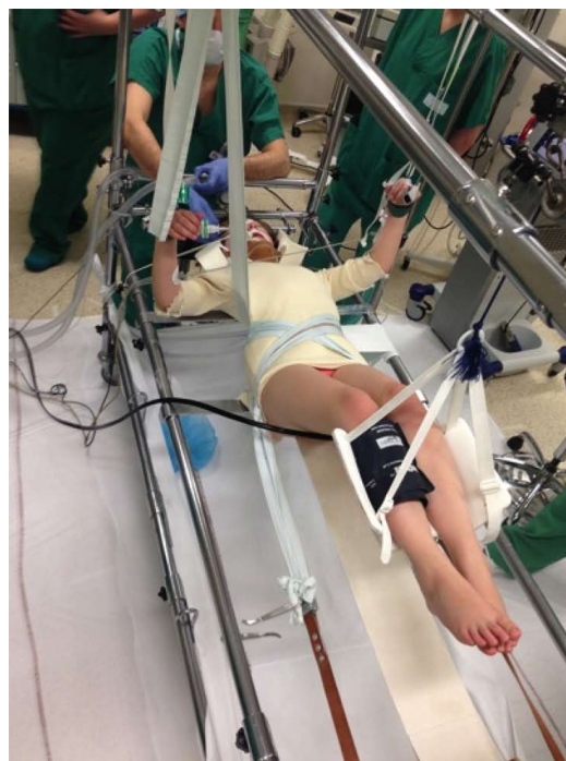
Figure 2 Positioning a patient on a Cotrel frame. Bottom view.

The EDF cast can be performed under general anesthesia [13] or, alternatively, with the patient awake [14] . Both options are effective [13-15] . Canavese et al. [13] recently reported that serial EDF casting done under general anesthesia and neuromuscular-blocking drugs improves outcome in patients with JS, specifically by enabling more effective control of curve progression in IS and JS patients compared to EDF casting under