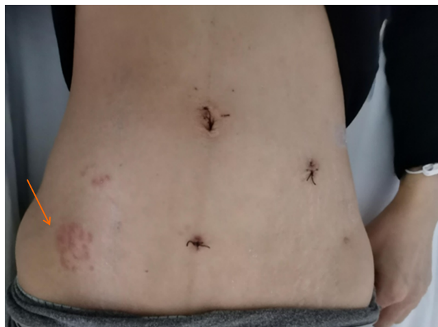
Figure 1 Clusters of red rashes. Clusters of red rashes can be seen on the patient's right lower abdomen (as shown by the arrow).