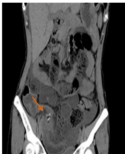
Figure 4 Representative coronal plane whole-abdominal computed tomography image. The position of the Hem-Lock clamp during the patient's previous laparoscopic appendectomy.

VZV reaches the ENS through two potential mechanisms: transportation by peripheral T-lymphocytes and retrograde axonal transport from dorsal-root ganglion neurons infected through their epidermal projections[13]. Regardless of the triggering factors, VZV reactivation is likely to have the same effect on the ENS neurons[11]. Various theories on the pathogenesis of zoster-related gut obstruction are: (1) Parietal and visceral peritoneal inflammation; (2) extrinsic autonomic nervous system viral involvement; (3) direct VZV injury of both the enteric submucosal and myenteric plexus, as well as the muscularis propria; (4) possible hemorrhagic infarction of the abdominal sympathetic ganglia; (5) viral interruption of afferent C-fibers that cause intestinal hypomotility and subsequent pseudo-obstruction; and (6) viral injury of the thoracolumbar or sacral lateral columns resulting in disruption of parasympathetic nerves and subsequent intestinal hypomotility[1,2,11,12].