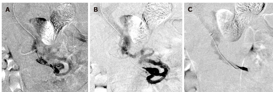
Figure 2 Laboratory tests, imaging, and treatment modalities. A and B: Selective superior mesenteric venogram after transjugular intrahepatic portosystemic shunt creation demonstrates a filling defect representing thrombus in the superior mesenteric venous (SMV), hepatofugal flow in a peripheral SMV branch, and a venovenous collateral decompressing the small bowel outflow into the main SMV trunk; C: Superior mesenteric venogram after aspiration and mechanical thrombectomy demonstrates reestablished flow in the previously occluded SMV, nonperfusion for the venovenous collateral, and hepatopetal flow in the peripheral SMV branches.

rtPA: Recombinant plasminogen activator; tPA: Tissue plasminogen activator.