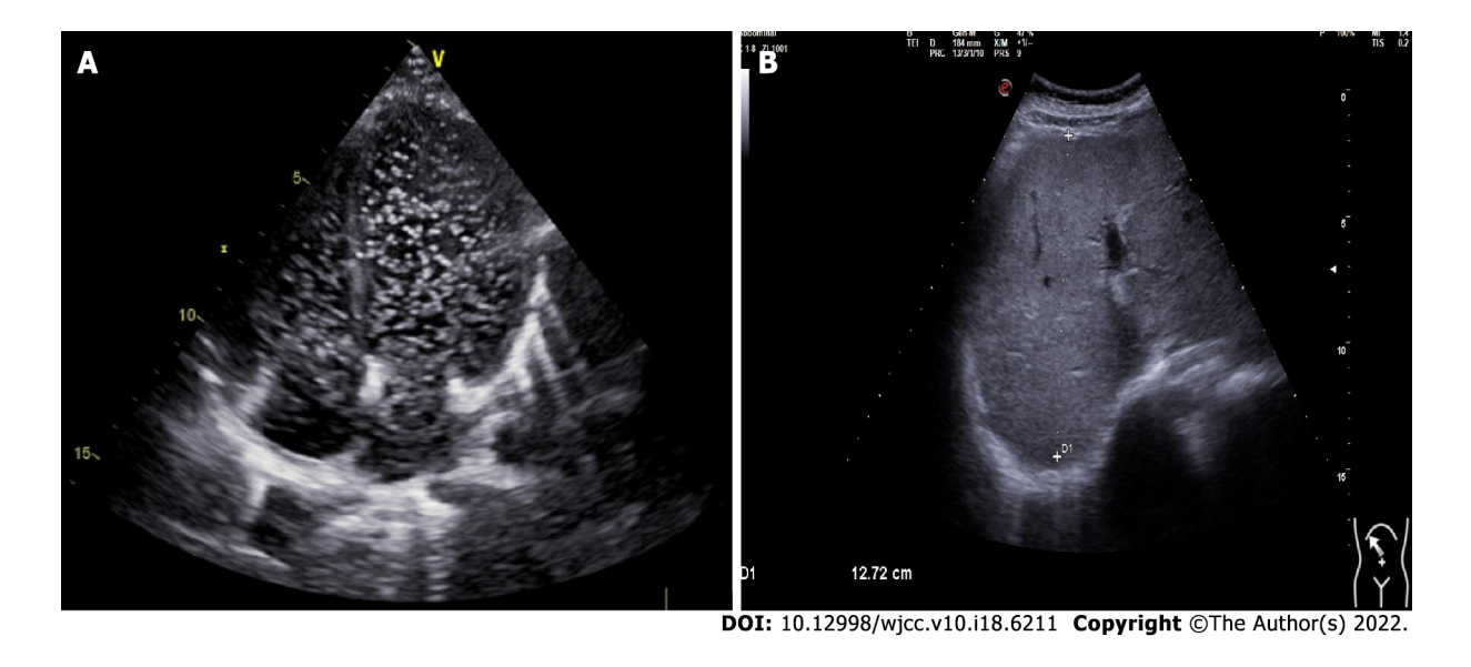
Figure 1 Ultrasonography. A: Right echocardiography revealed diffuse arteriovenous shunt in the lung (grade III > 100/frame), consistent with hepatopulmonary syndrome; B: Abdominal ultrasound displayed bile duct dilatation, cirrhosis, and splenomegaly.

intractable diabetes insipidus hypothalamic-pituitary insufficiency, severe electrolyte disorder, and neuropsychological defects, which seriously affect the quality of life of children.