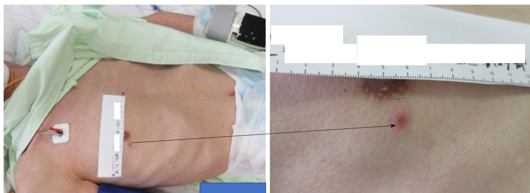
Figure 1 The skin lesion on the right chest.

CFT: Complement fixation test; HSV: Herpes simplex virus; PCR: Polymerase chain reaction; VZV: Varicella-zoster virus.