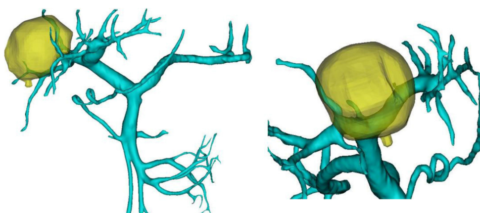
Figure 1 The tumor was closed to the middle hepatic vein.

DOI: 10.12998/wjcc.v10.i20.7130 Copyright ©The Author(s) 2022.