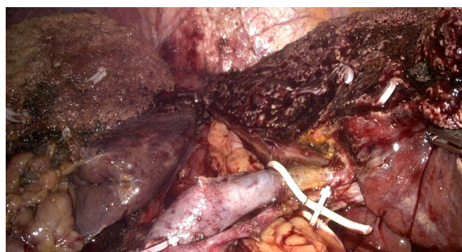
Figure 2 The tumor was closed to the right branch of the portal vein.

DOI: 10.12998/wjcc.v10.i20.7130 Copyright ©The Author(s) 2022.