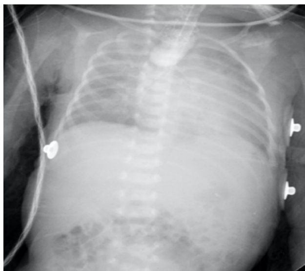
DOI: 10.12998/wjcc.v10.i21.7592 Copyright ©The Author(s) 2022.