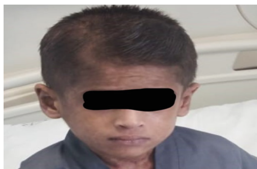
Figure 1 Skin rash that appeared during the sixth week of admission. A: Disseminated vesicular rash that was thought to be dermatitis herpetiformis associated with celiac disease and found to be eczema herpeticum with positive polymerase chain reaction result for herpes simplex virus from the lesions and blood; and B: Closer image of the lesions involving the face.

DOI: 10.12998/wjcc.v10.i29.10735 Copyright ©The Author(s) 2022.