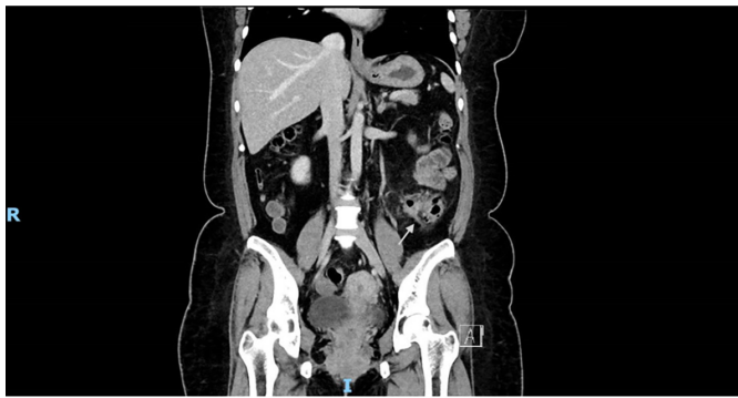
Figure 1 Computed tomography of abdomen pelvis coronal cut, showing signs of pericolic fat stranding and extraluminal air pockets fluid density with peritoneal thickening at the sigmoid colon, likely representing a sealed perforation.