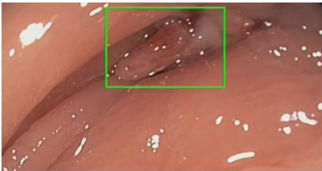
Figure 2 Endoscopic image of exophytic polypoid lesion closely associated with a diverticulum seen in the sigmoid colon.