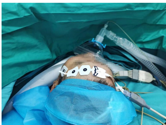
DOI: 10.12998/wjcc.v11.i14.3330 Copyright ©The Author(s) 2023.