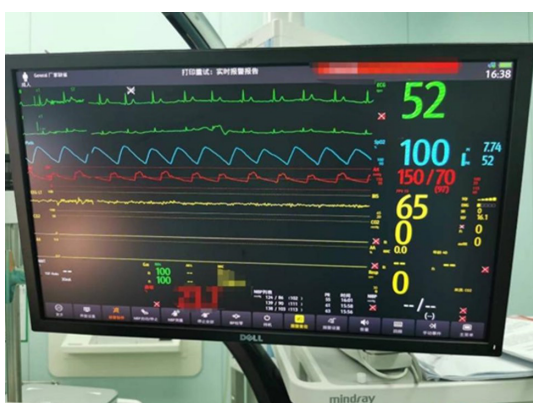
DOI: 10.12998/wjcc.v11.i14.3330 Copyright ©The Author(s) 2023.