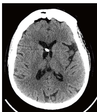
Figure 1 Intraoperative computed tomography of the head demonstrates intraventricular placement of the pump catheter (Patient 6).

VAS: Visual analogue scale; ICV: Intracerebroventricular.