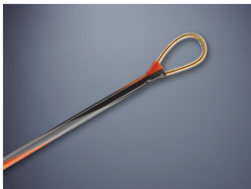
Figure 1 Loop-tipped guidewire. A 0.035-inch guidewire (Loop tip: Cook Medical Corp., Winston-Salem, NC).

Serum amylase level was measured before and about 18 h after ERCP. The reference range for amylase was 42-135 IU/L. Patients were clinically evaluated for symptoms (abdominal pain, nausea, etc. ) and physical findings (abdominal tenderness).