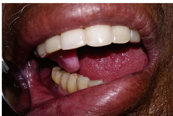
Figure 4 Palatal guiding flange prosthesis.