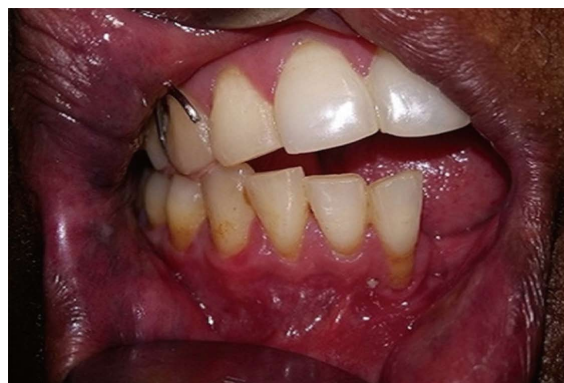
Figure 5 Occlusion contacts established with prosthesis.