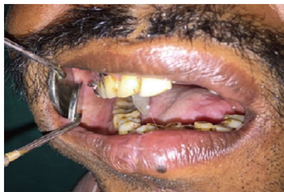
Figure 8 Mandibular first molar contacting the palatal ramp that guides the mandible to occlusion.

Segmental resection of mandible results in deviation of remaining segment towards the resected side due to uncompensated influence of contralateral musculature, particularly the internal pterygoid muscle. If this influence is uncompensated, the contraction of cicatricial tissue will fix the residual fragment in its deviated position [5] . The rotation of residual mandible in