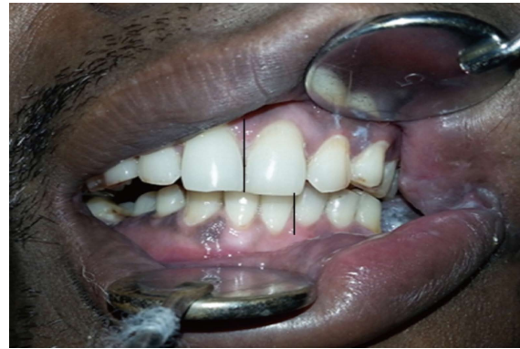
Figure 1 Midline shift and loss of occlusal contact.

Impressions were made with modified stainless steel stock tray and irreversible hydrocolloid (Tropicalgin, IDS DENMED Pvt. Ltd.) followed by pouring cast with