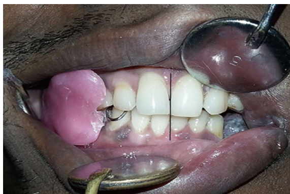
Figure 3 Correction of deviation after insertion of the prosthesis.