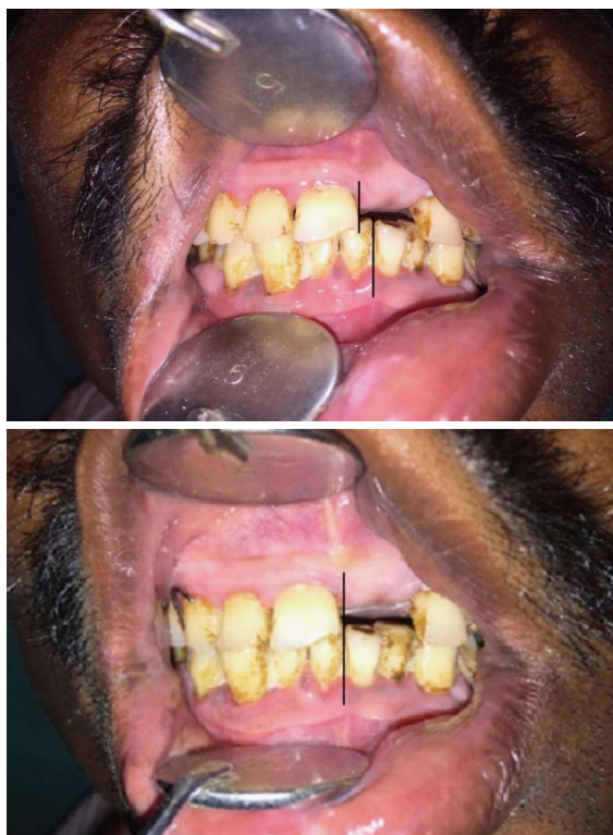
Figure 7 Note the midline before and after insertion of the prosthesis.

the history of hemimandibulectomy and left maxillary alveolectomy reconstructed with masseter flap done two weeks ago owing to carcinoma left buccal mucosa. Mouth opening was noted as 30 mm. It was noted that the deviation of mandible towards the resected side was minimum as the surgery was done only two weeks ago. If intervention with the GF was not done at this time, the deviation would worsen on healing process and scar formation. The procedure of impression making, cast, interocclusal record and articulation as in case report 1 was done. As the deviation was minimum, palatal GF prosthesis was planned for this case. As opposing teeth were present in the mandibular arch, the risk of supraeruption is nil. The prosthesis extended till the lingual sulcus on palatal non resected side. The prosthesis was tried in patient mouth and trimmed accordingly (Figure 7). The patient was able to guide the mandible into pre-existing occlusion (Figure 8). The patient was advised to wear the flange at all times except while eating and during nights and was asked to review after one week.