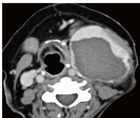
Figure 2 Transverse computed tomography of left internal jugular vein aneurysm.