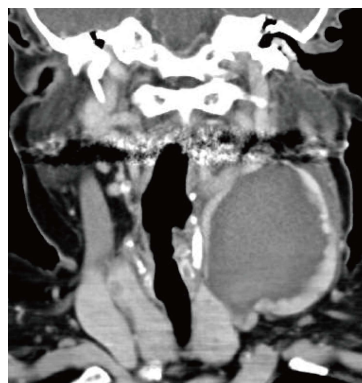
Figure 1 Coronal computed tomography of left internal jugular vein aneurysm.

NF1 aka von Recklinghausen's disease is an autosomal dominant mutation of chromosome 17 occurring in 1 in 3000 people that alters the neurofibromin protein, affecting the structural integrity of connective tissues and nerves [12,13] . Typical presentations include neurofibromas, café au lait macules, Lisch hamartomas, meningiomas, and gliomas [13,14] . Rarer manifestations involve the vasculature which can be present in up to 6.4% of patients, however it primarily involves the arterial system [12,15] . We present a case of the successful ligation and excision of one of the largest IJ vein aneurysms in the literature and one of only five associated with NF1.